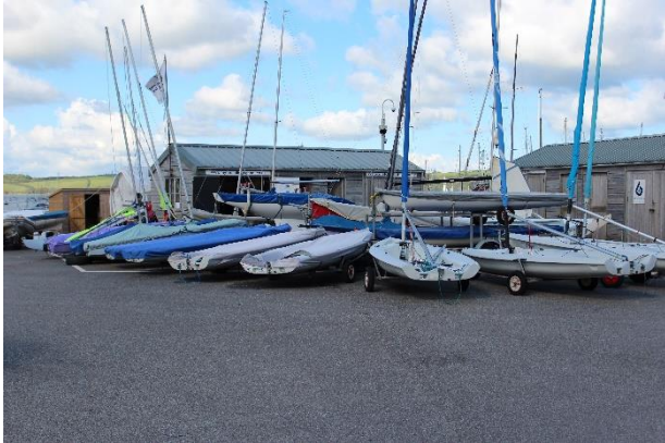
Outside Main School Hut

Most of the sailing school and classroom access is level with a slight downhill part towards the slipway and pontoon for boarding the boats. There is no handrail on the pontoon but staff are available to accompany anyone.