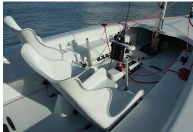
With added Support Seats