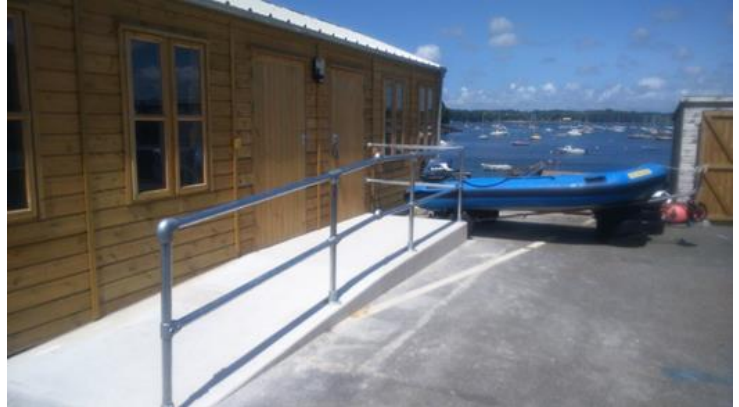
Ramped classroom access 1:12

Seats are available and laid out in front of the sailing school for ease of putting on waterproofs and life jackets.