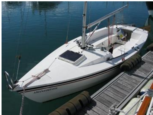
Hawk 20 Keelboat

We are currently planning to add a new keelboat to the fleet in 2017 where we can hoist those people who cannot sit unaided into a support seat.